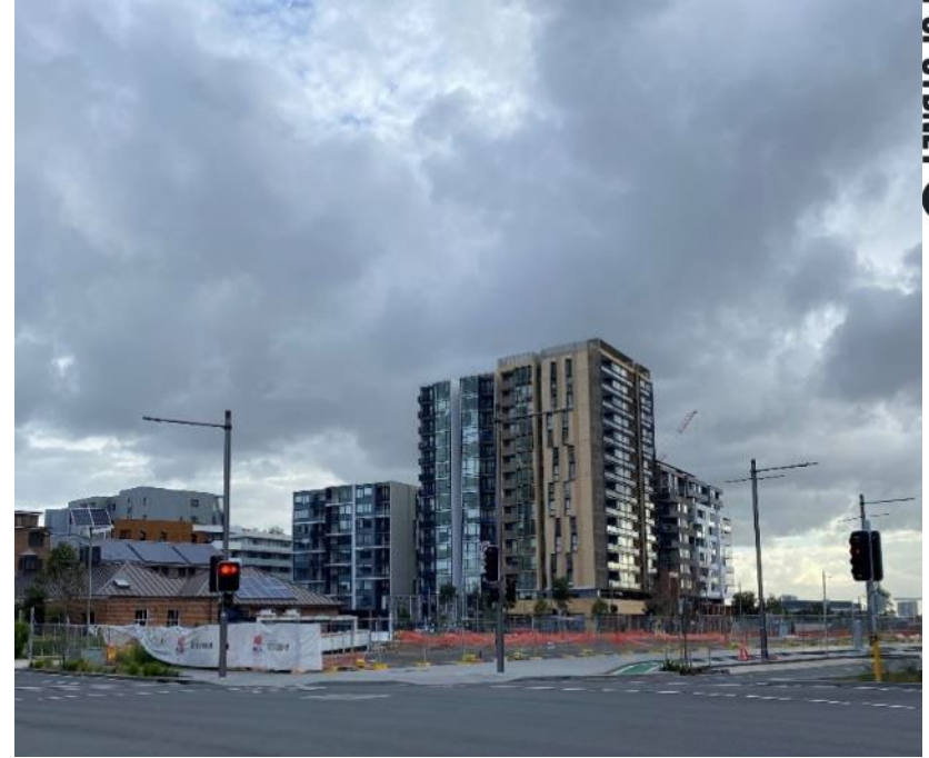
looking south west