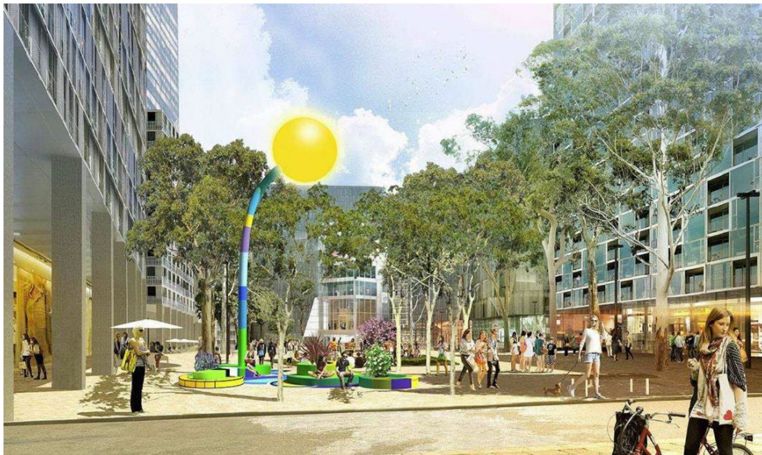
artist's impression of Site 1 proposal