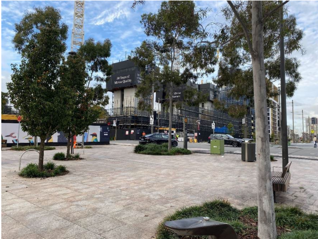
Site1 looking east