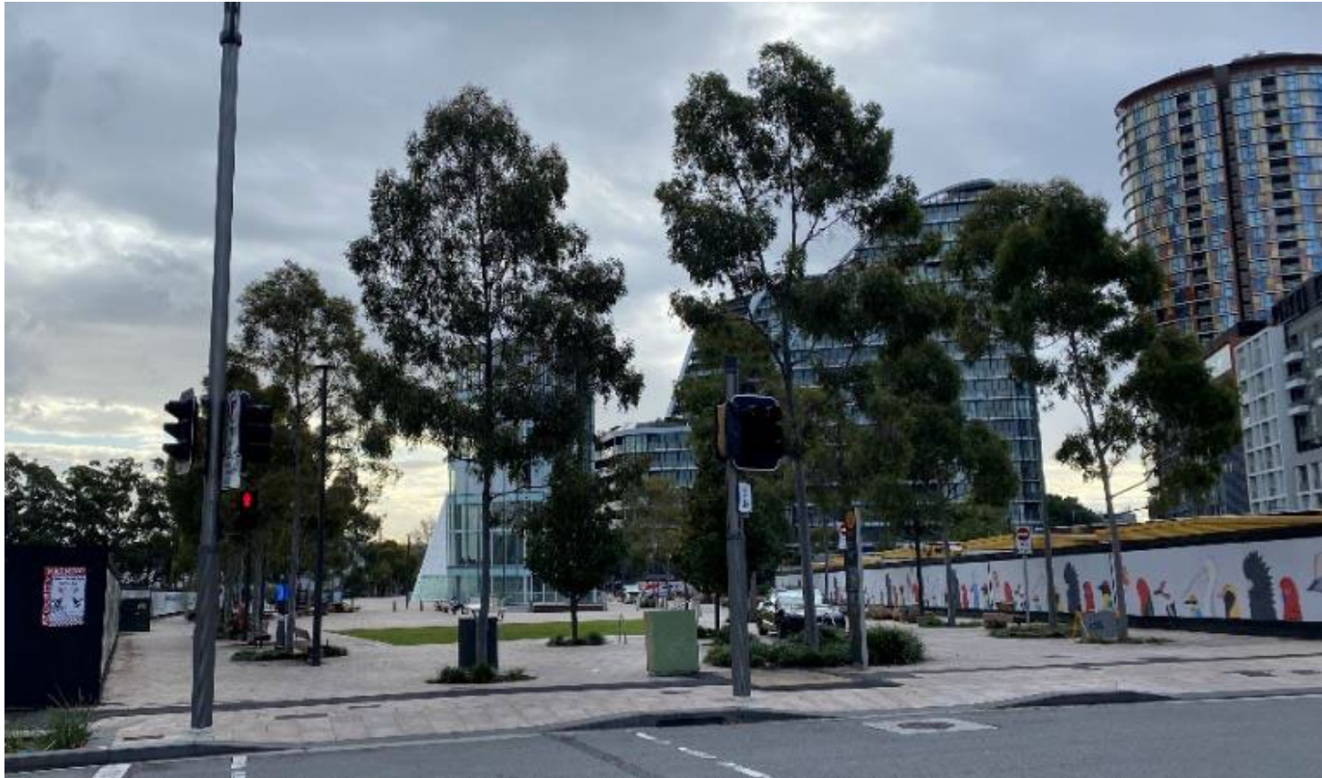
Site 1 viewed from Paul Street looking west