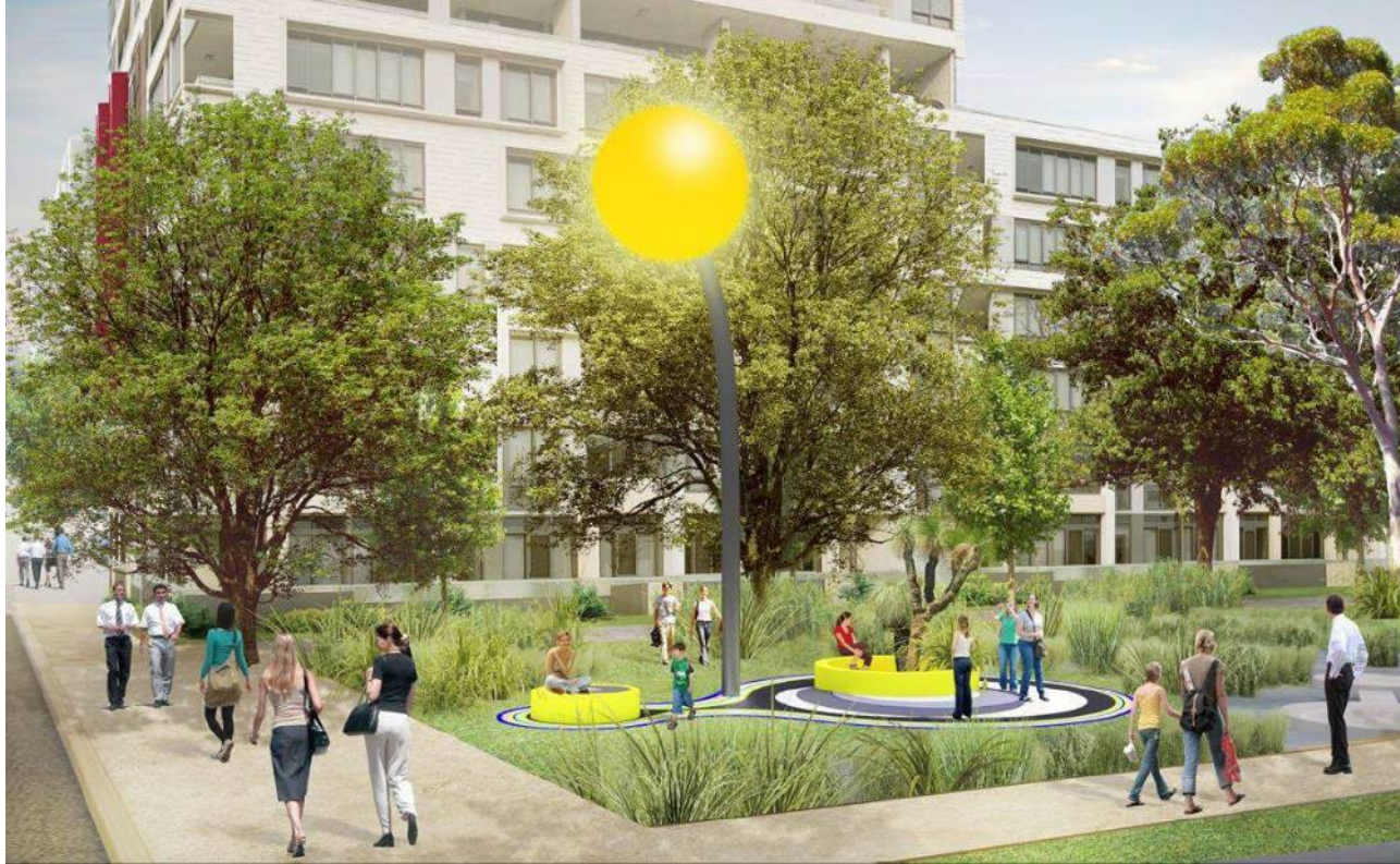
artist's impression of Site 4 proposal