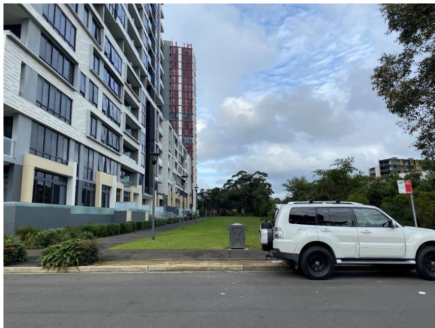
looking south east