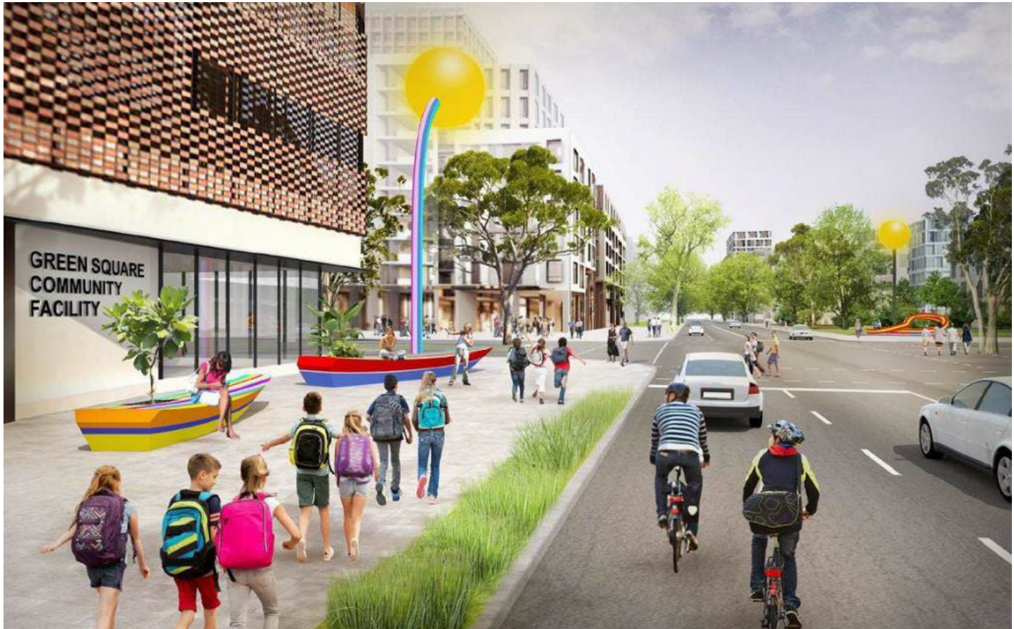
artist's impression of Site 2 proposal